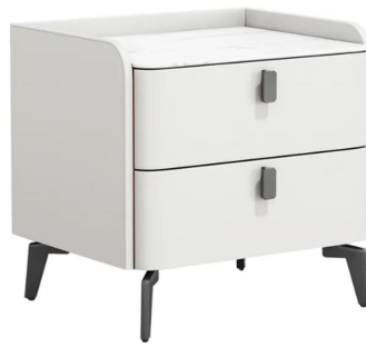
Step 2: Installation is complete, as shown in picture 4.