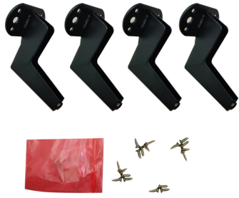
Parts List, as shown in picture 1.