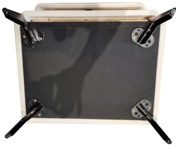
Step 2: Install 4 legs on the backboard as shown in picture 3.